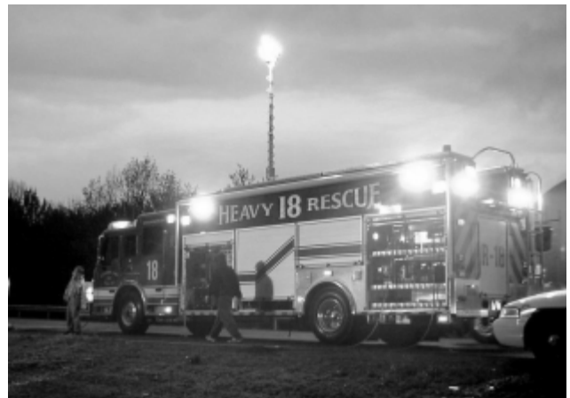
Clifford's newly commissioned Heavy Rescue 18 vehicle at an I-81 accident scene.