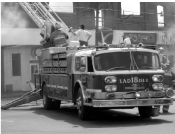
Clifford Township Volunteer Fire Company at the recent Carbondale fire with Ladder 18.