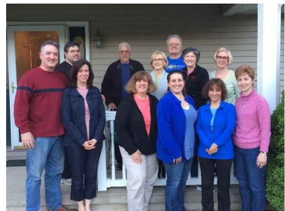
2017 Harvest Festival planners

St. John Vianney Parish 704 Montdale Road Exit 201 off Rt. 81 (2 ½ miles follow sign.)