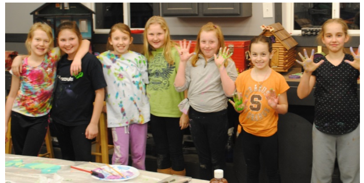
Girl Scout Troop 50774 Painting at the Garden

unique acre of learning and exploring. Township supervisors have supported the installation of a bathroom and other improvements in the Garden House. Plans are to add a log cabin and covered wagon at the early settler's farmstead, an Indian Village and a dinosaur nest and mural this Spring and early Summer. The Garden is open to the public for you to explore. We hope to have our Grand Opening later this year, although the Garden will not be completely finished for at least another year.