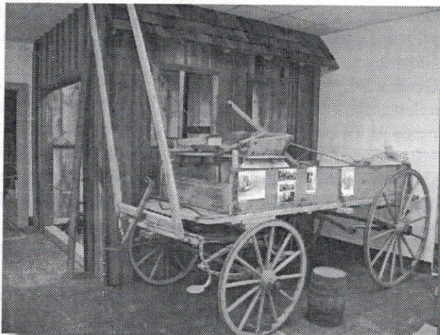
Recreated Blacksmith Shop at the Museum