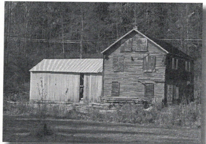
The Yarns Cider Mill at the Suraci Farm

Grant funds from the Endless Mountains Heritage Region, Inc., matched by incredible donations of local time, materials and money will make these goals a reality. In 2015, we will tackle the challenge of preparing the original pressing equipment to operate once more.