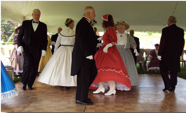
Top Hats and Lace Dancers

The Historical Society will be selling homemade apple butter and a few flavors of jelly and jam at the Mountain View Garden Club plant exchange and at other area businesses. Sales were great last year and we hope you will support our efforts again.