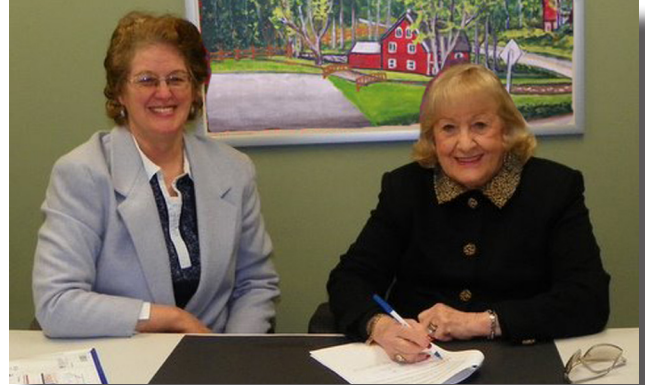
Historical Society leases old Yarns Cider Mill

The volunteer firemen have asked the Historical Society to create a larger display for their picnic this year. Look for us at the space next to the pizza stand. We will be displaying information on the old Elk Mountain fire tower and some fun exhibits for the kids.