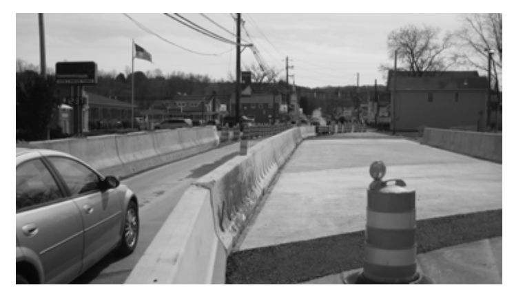
Main St. bridge nearing completion: 03/27/10

Bridge : It's been almost four years since the Main Street bridge washed out. Downtown Clifford businesses plan to celebrate the new bridge opening (June?) to welcome people back!